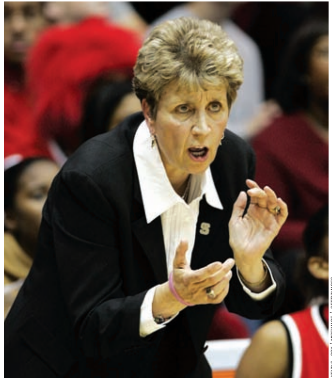
▲ Dreamer: N.C. State head coach Kay Yow motivated and inspired her players on the court, and also after her death. A new book talks about leaving a legacy and bases that idea on the life of the legendary coach who passed away from cancer earlier this year.

Part of Coach Yow's plan was to stay in touch with her former players through hand-written